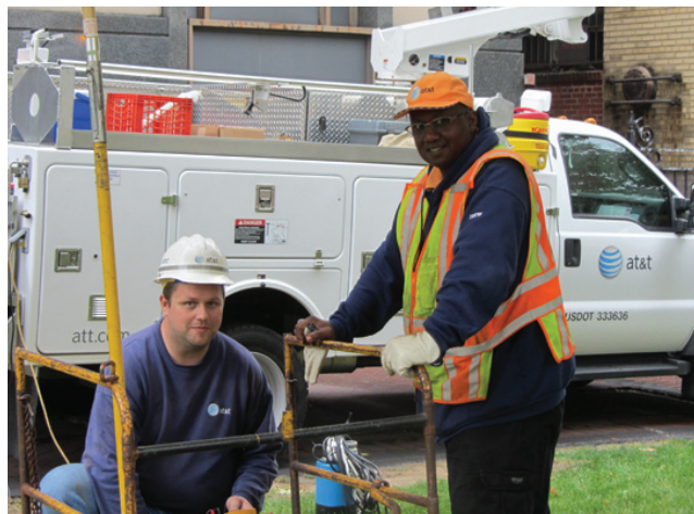
Members on detail working outside of the Peoria call center.