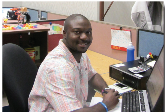
Members working in the Peoria Call Center.

VISIT US ON THE WEB: IBEW21.ORG LIKE US ON FACEBOOK!