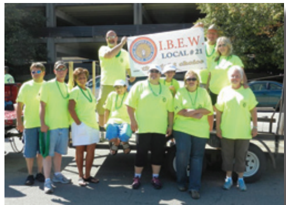
Springfield Members at the Labor Day Parade

To this day the Pullman neighborhood still remains a focal point in the battle of labor equality. This historic site sits next to the Comcast shop IBEW 21 has been organizing. Workers there are being suppressed by one of today's corporate barons, Brian Roberts.