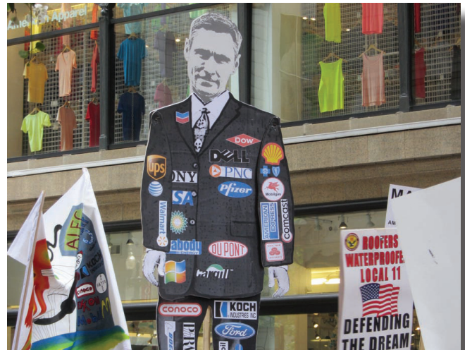
Union members getting back to the basics hit the streets to protest ALEC's union busting agenda.